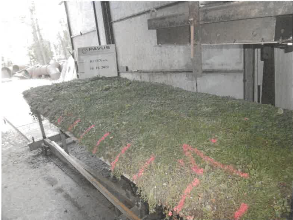
Test specimen No. 1 prior to the test beginning

In the Annex, the photographs representing specimen No. 1 are documented. Results of specimen No. 2 are similar.