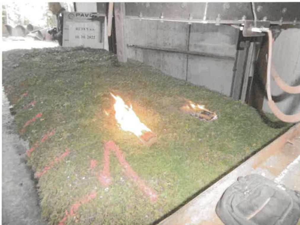
Test specimen No. 1, 9 th test minute