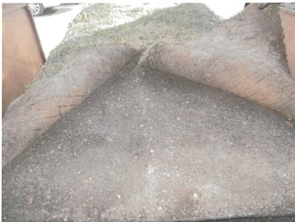
Test specimen No. 1 after opening