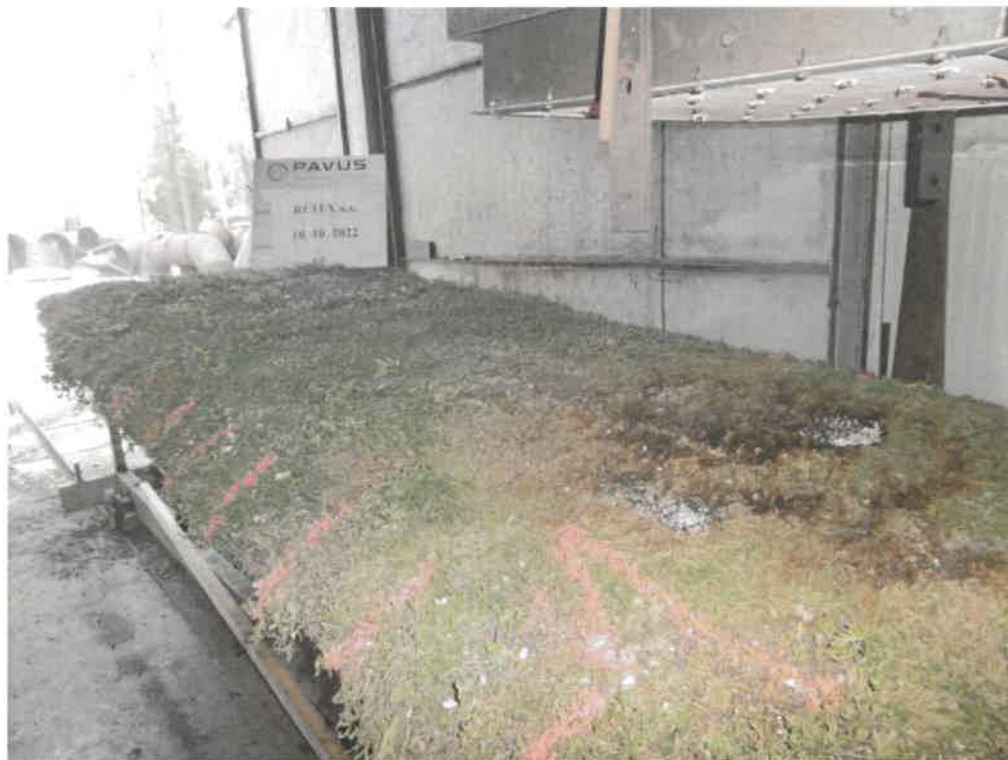
Test specimen No. 1, 19 th test minute